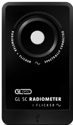
GL SC RADIOMETER + FLICKER